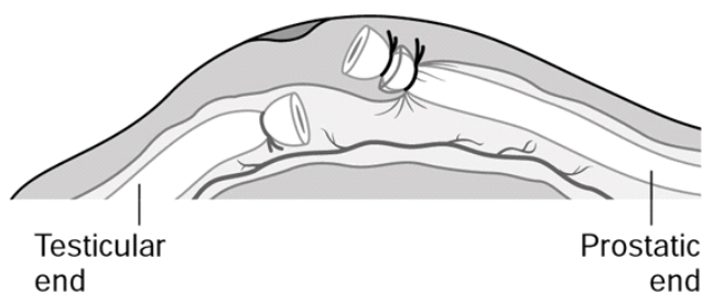
Figure 1 Vasectomy procedure using ligation and excision combined with fascial interposition over the testicular end.

NSV = No Scalpel Vasectomy, FI = Fascial Interposition, V = Vicryl, S = Silk, C = Cotton.